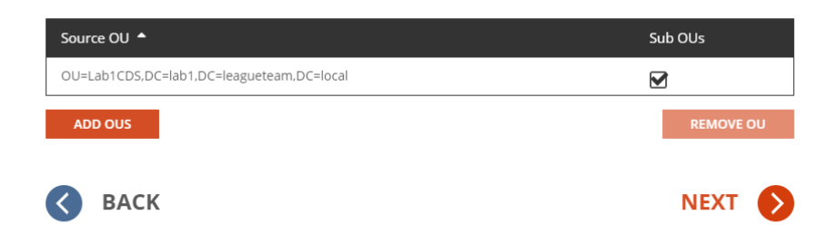
Figure 2: Example Source OU setup.

These are the source OUs you wish to synchronize. Double-click on any OU for advanced filtering options.