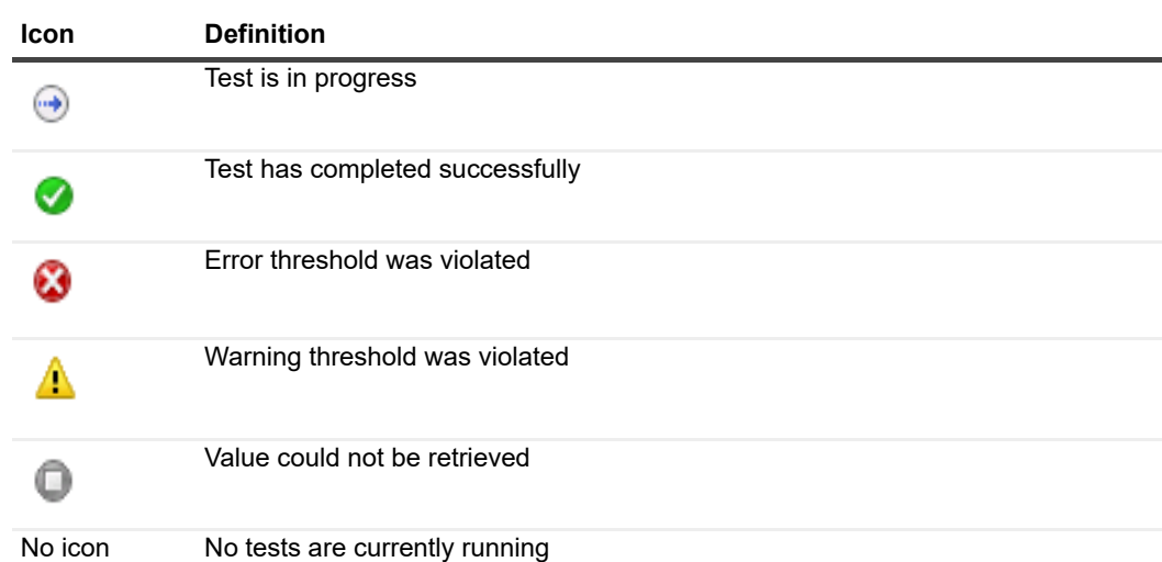
Table 4. Test result icons.

Colored icons adjacent to a test in the Test node, servers in the organization node, or tests in the Test Results window indicate the following test status: