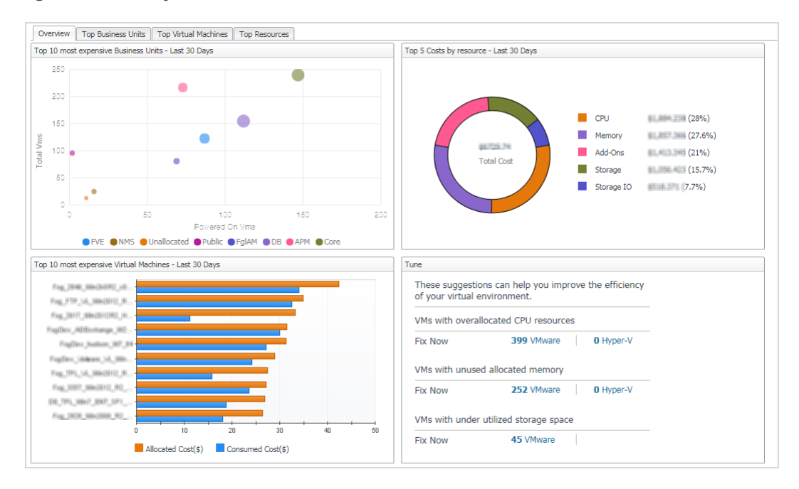
Figure 2. Summary - All Servers view