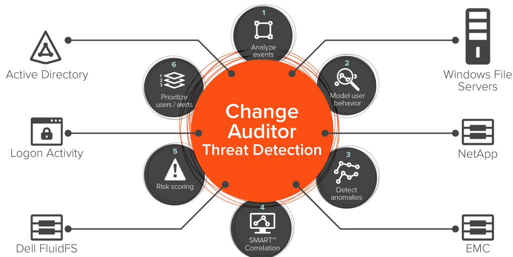
Figure 2. Overview of the Change Auditor Threat Detection input sources and threat assessment process

Threat Detection process includes the following steps: