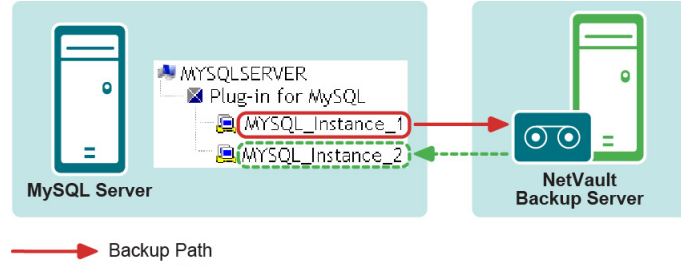
Figure 1. Data backed up on one MySQL Instance and recovered to different instance

In this form of relocation restore, a Plug-in for MySQL backup is to be restored to the same MySQL Server machine, but to a different instance of MySQL that has been configured there.