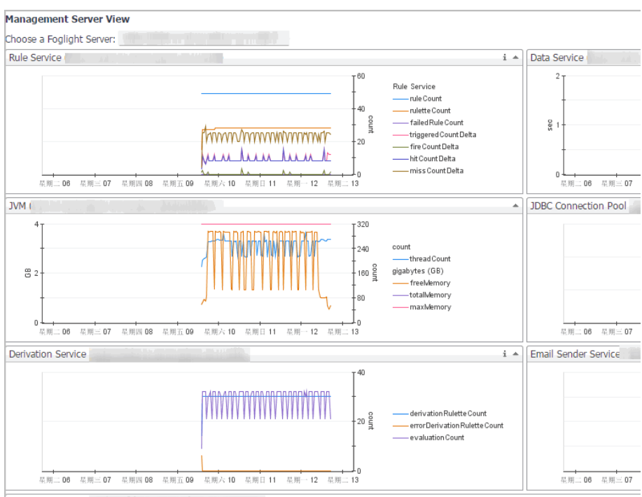
Figure 7. The Management Server View.