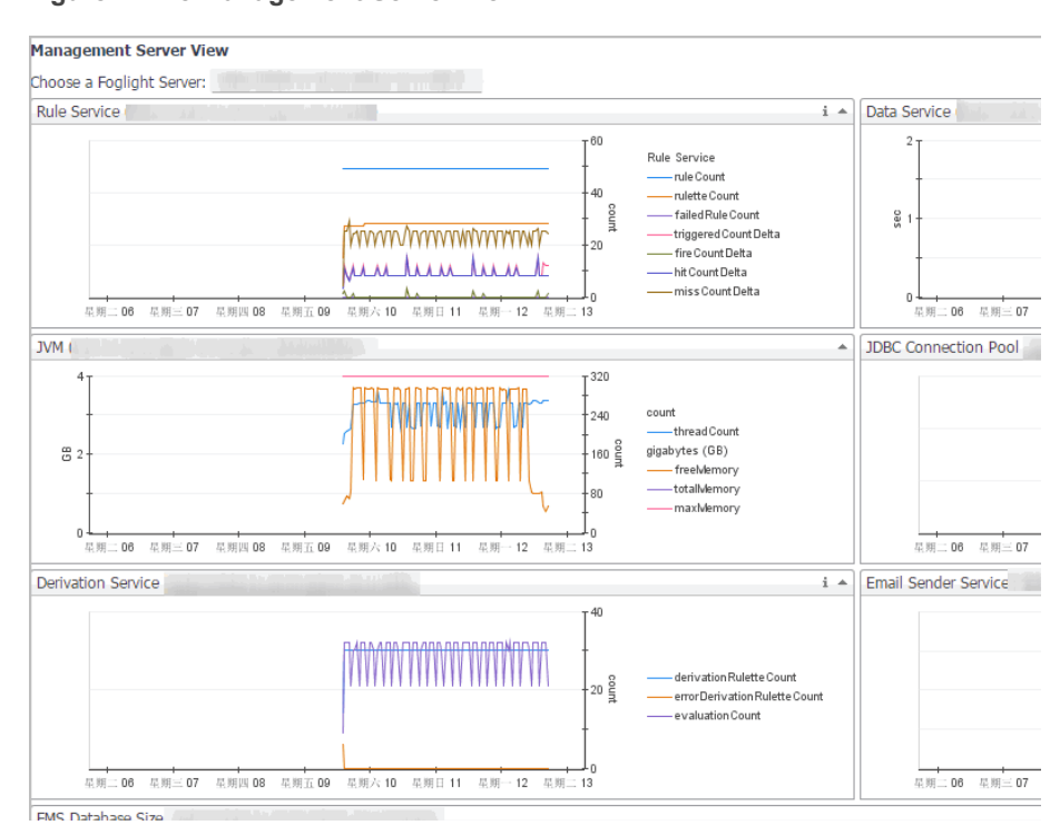
Figure 7. The Management Server View.

Server log files are another source of information that can help you diagnose the root cause of performancerelated bottlenecks. They contain information about known events and error conditions as well as verbose or informational messages. The Log Analyzer dashboard allows you to analyze generated log files or download a selected log file to a desired location. To access this dashboard, from the navigation panel, click Dashboards > Management Server > Diagnostic > Log Analyzer .