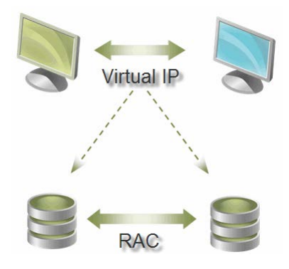
Figure 2. Cluster configuration

This section describes one scenario for running the Foglight<sup>®</sup> Management Server in HA mode with clustering at the application layer. In particular, the focus is on operating system level clustering used in commercial systems such as Oracle<sup>®</sup>, Microsoft<sup>®</sup>, and Veritas<sup>TM</sup> clusters.