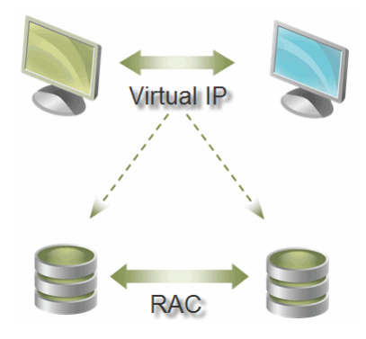
Figure 2. Cluster configuration

This section describes one scenario for running the Foglight<sup>®</sup> Management Server in HA mode with clustering at the application layer. In particular, the focus is on operating system level clustering used in commercial systems such as Oracle<sup>®</sup>, Microsoft<sup>®</sup>, and Veritas<sup>TM</sup> clusters.