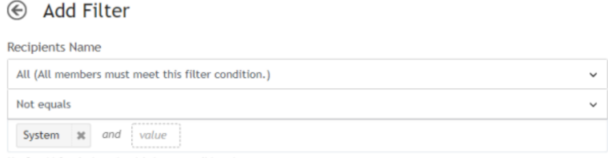
Use ? and * for single and multi-character wild cards.