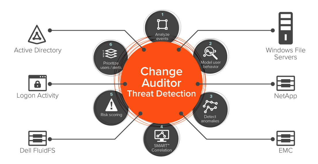
Figure 2. Overview of the Change Auditor Threat Detection input sources and threat assessment process

Threat Detection process includes the following steps: